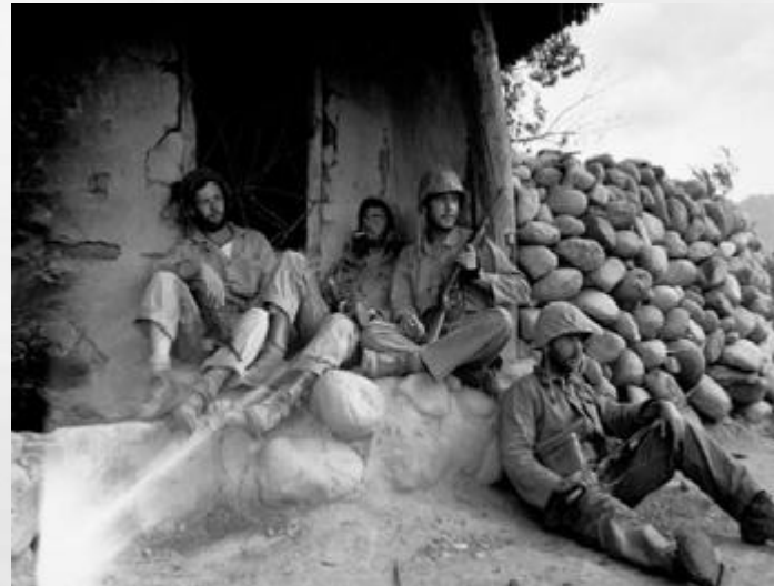
KOREAN WAR (1950 - 1953)

VFW STANDS FOR VETERANS OF FOREIGN WARS.